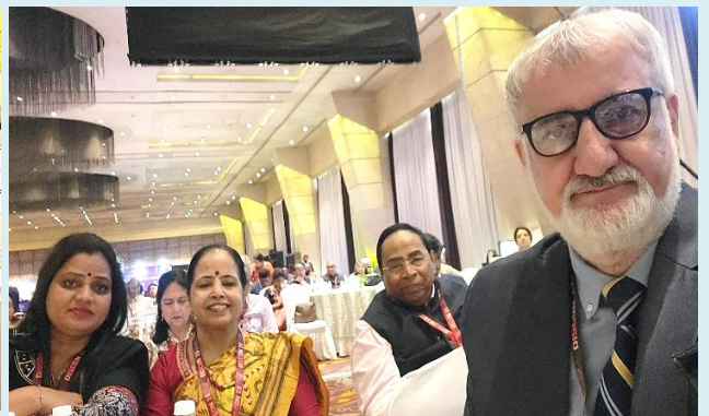
Meeting up with members of RC Lokhandwala Kandivali ----- Met the Rotary Friendship Exchange team from Canada