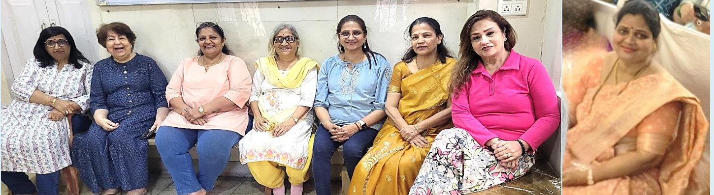
THE AWESOME WOMAN POWER OF ROTARY CLUB OF MARINE DRIVE MUMBAI