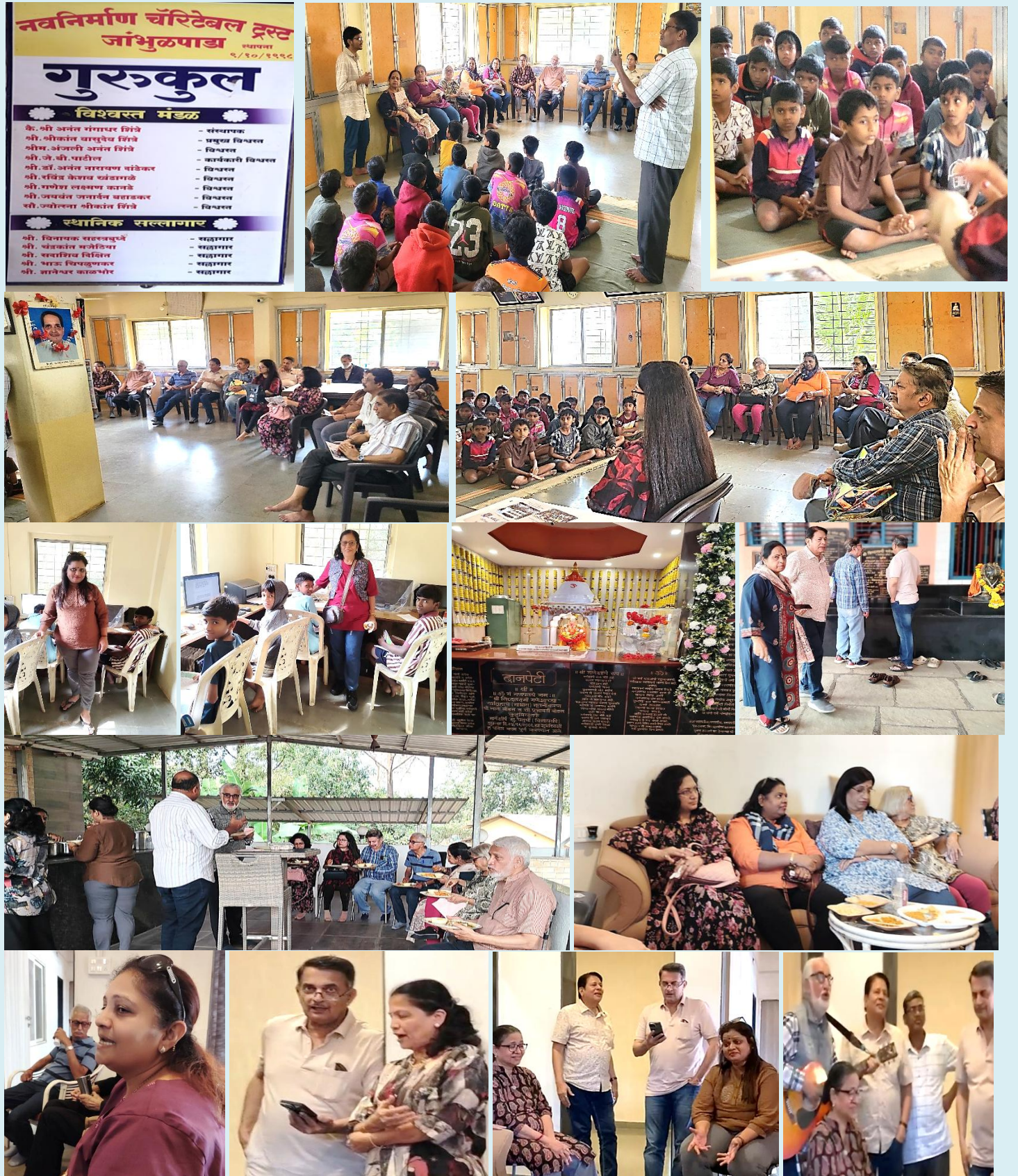
All in all, a fabulous, enjoyable, fun-filled, entertaining Fellowship Picnic plus regular meet @KHOPOLI .....8.